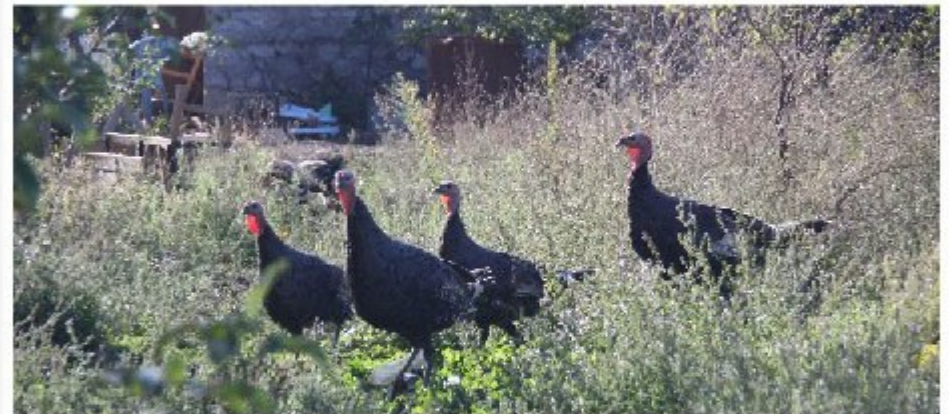
Impressionen von unterwegs