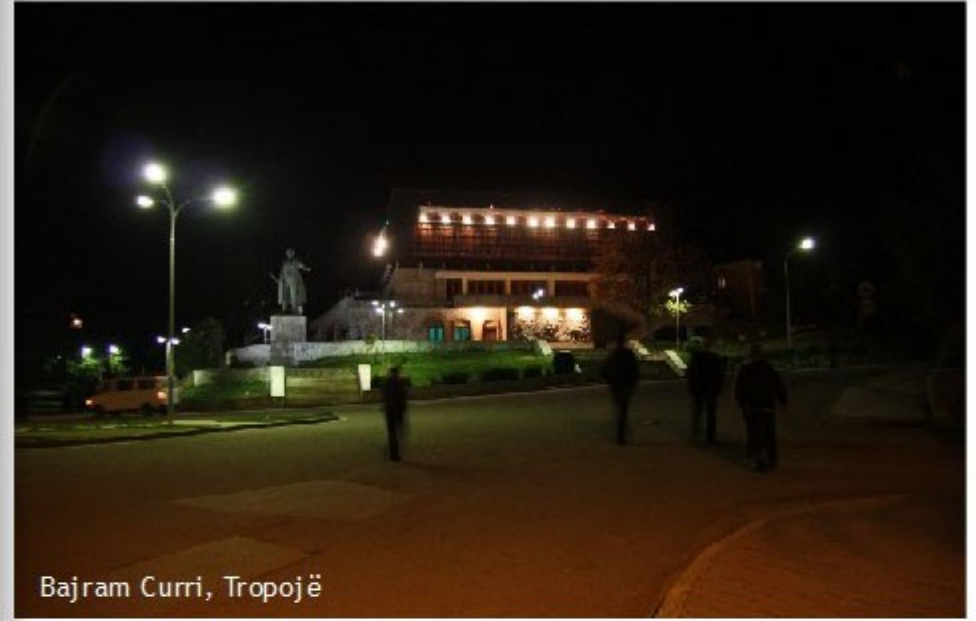
Bajram Curri, Tropojë