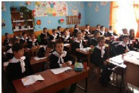
Grude e Re, Shkodër