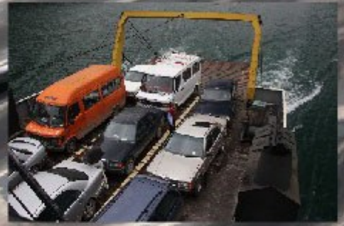
Fähre Koman - Fierzë, beim Staudamm in Koman