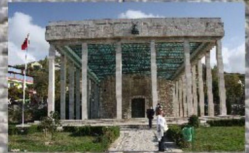
Grab- und Gedenkstätte von Gjergj Kastrioti Skanderbeg, Lezhë